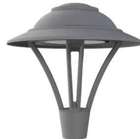
S-OSP TTT with Skirt

Transitional configuration with skirt and 'TTT' top, shown here in red box, was preferred by majority vote.