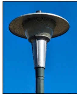
Massey Victory Heights Aug 2025