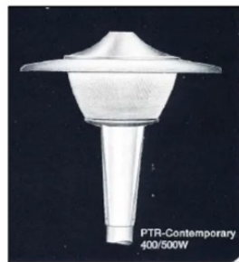
The Sylvania Twist Pak Post Top Refractor Model.