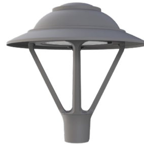
S-OSP TCC with Skirt

Transitional configuration with skirt and 'TTT' top, shown here in red box, was preferred by majority vote.